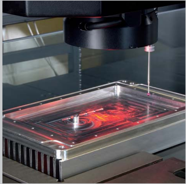
certified quality management