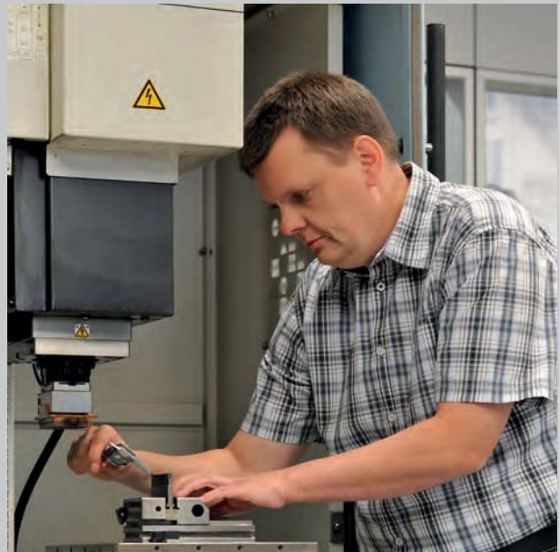
own tool-making department