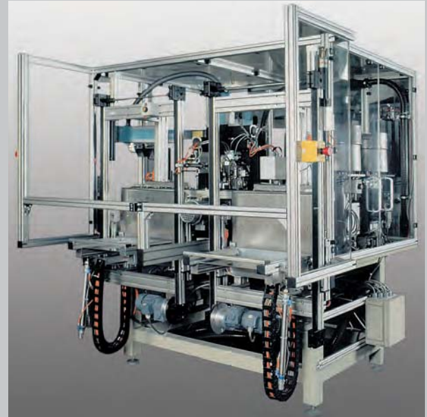
efficient special machines