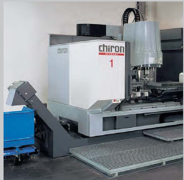
up-to-date milling technology