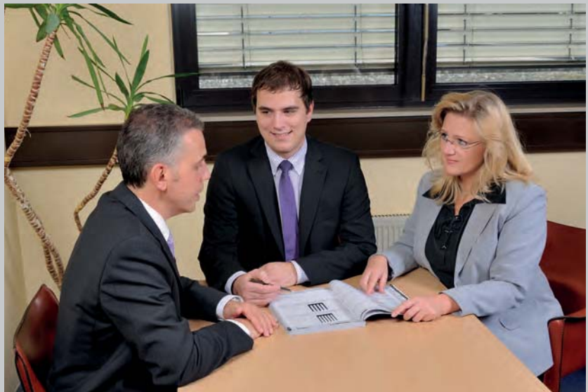
committed field service