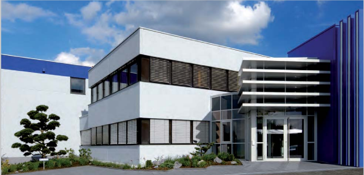
foyer of the company