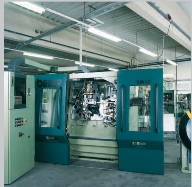
precise punching department